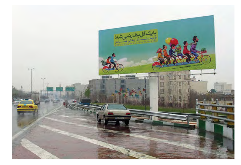
As Parliament moves forward with a bill restricting women's reproductive rights and access to family planning, a billboard in Tehran encourages Iranian women to have more children.

An editorial, "Women's Employment and Damage to Family Foundation," published in January 2013 by the Fars News Agency, which is associated with the Revolutionary Guards, elaborated more fully on the conservative view of women's employment: "Because of society's liberal models, some believe