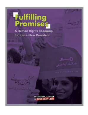
Fulfilling Promises: A Human Rights Roadmap for Iran's New President