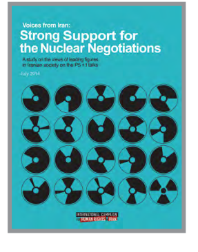
Voices from Iran: Strong Support for the Nuclear Negotiations