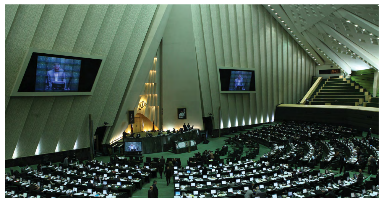
Bills violating the rights and endangering the safety of Iranian women continue to make their way through the hardline-dominated Iranian Parliament.

is the issue of chastity and hijab. Unfortunately, we are not dealing with it properly. The government must begin enforcing chastity and hijab in government offices and slowly spread this effort to other areas."<sup>30</sup>