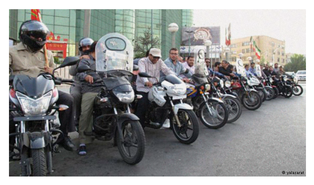
Ansar-e Hezbollah forces on their motorcycles in Tehran's Shahrak-e Ghods neighborhood in July 2014.

The designation of the Basij as the principal enforcers of the Plan to Promote Virtue and Prevent Vice formalized the role of vigilante groups that had in fact already become active in the run-up to the legislation. Indeed, the movement to propel rigid public enforcement of strictly conservative notions of Islamic female piety has long been led by a vigilante group—the militant Islamic group Ansar-e Hezbollah (or Nation of Hezbollah).