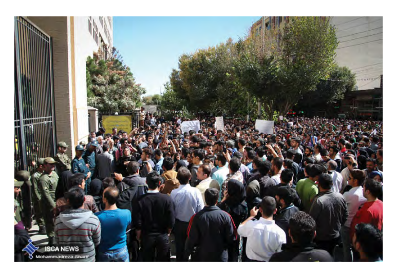
Thousands outside the Judiciary building in Isfahan, on October 22, 2014, peacefully protest the acid attacks, until plainclothes agents dispersed the crowd with batons and tear gas.

"Today we see that in Tehran and big cities that nothing is done to promote virtue and prevent vice in regards to the hijab. In these areas, ladies wear scarves that don't cover their hair. We must do what is necessary and promote virtue and prevent vice more often."<sup>29</sup> In a speech a few days later he added, "One of the country's biggest cultural issues