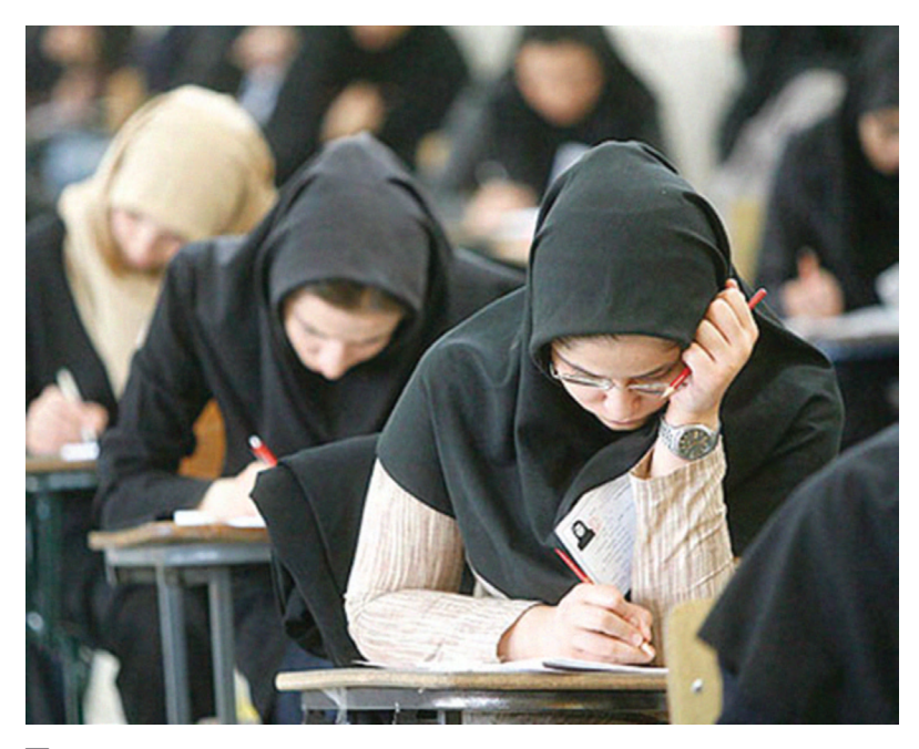
Female students are subjected to gender-based university admission quotas and restrictions on fields of study.

attendance, triggered a reactionary backlash that came to fruition under the (previous) hardline administration of Mahmoud Ahmadinejad.