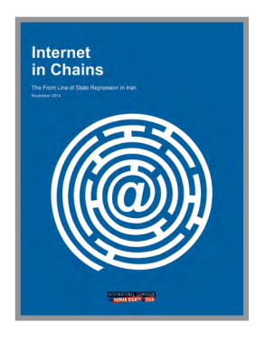
Internet in Chains: The Front Line of State Repression in Iran

by the International Campaign for Human Rights in Iran