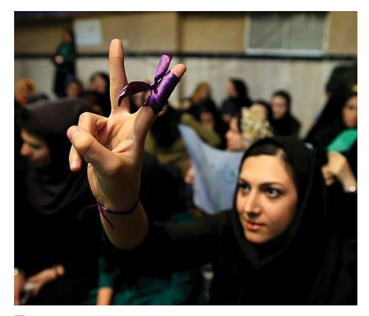
Rouhani said in a campaign speech on June 9, 2013, "In [my] government... no one will (be allowed to) violate women's rights in the name of Islam, because I will not be hiding behind the veil of religion and piety."

"Sometimes when there is talk of offering guidance and religious fact, some people say we are not responsible for sending people to heaven. Actually we are. This is the distinction between an Islamic theocracy and other types of governments. The Islamic ruler wants to act in a way that would deliver people to heaven; to the true and eternal happiness. We must pave the path (to paradise). We are not talking about forcing things and compelling people, but helping them. People intuitively seek salvation. We must clear the path and make getting to heaven easier for them. This is our duty."<sup>35</sup>